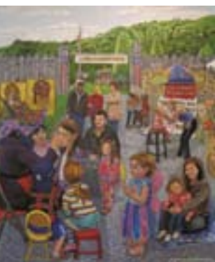
Old Bethpage Restoration