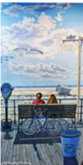
Jones Beach Boardwalk