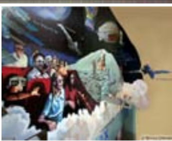
Cradle of Aviation Museum