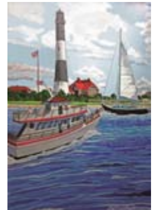
Fire Island Lighthouse