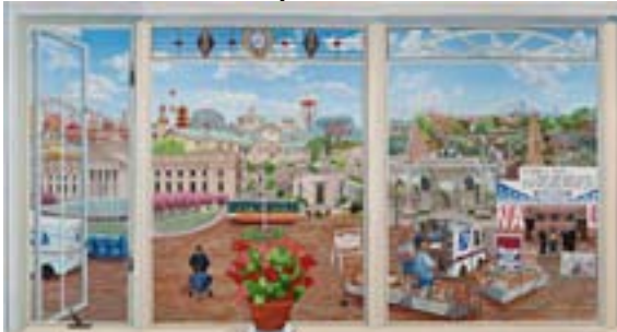
Brooklyn Picture Window