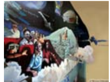
Cradle of Aviation Museum

Original works of art that represent pride, history and a connection to beloved New York Historic locations.