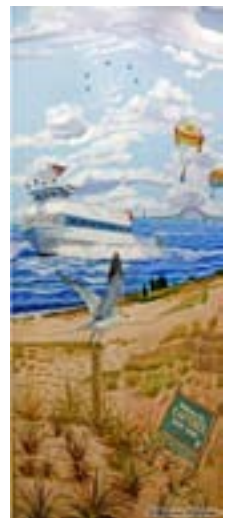
Captree State Park

The Long Island paintings were created for the pediatric wing of Mid-Island Dental in Hicksville, NY. They commissioned her to create soothing and relaxing environments for patients, while at the same time expressing Long Island pride that appealed to both children and adults. The project which consisted of 15 murals, covering over 1,100 sq. ft of wall space, began in the fall of 2011 and took approximately 2 years to complete. They included famous locations such as Adventureland, Captree State Park, The L.I. Cradle of Aviation Museum, the Jones Beach Theatre and Boardwalk, Harbes Family Farm, Old Bethpage Village Restoration and Atlantis Aquarium. As this project progressed, along came Hurricane Sandy, which significantly altered many of the beaches. This only made Bonnie Siracusa's passion even greater, to bring these places seemingly to life, and preserve their beauty forever, through her exceptional attention to detail and rich color.