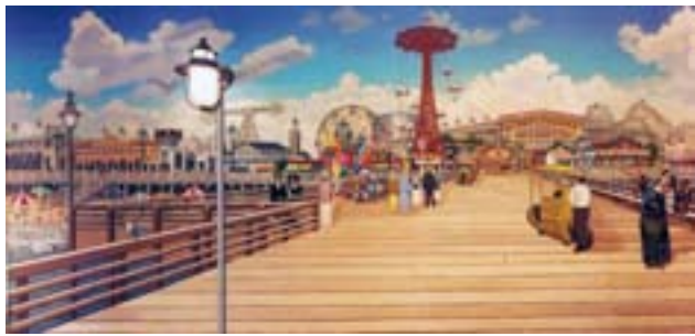
Coney Island Boardwalk