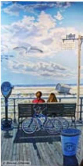
Jones Beach Boardwalk