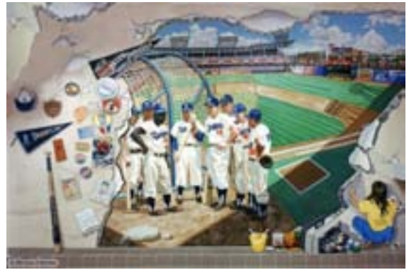
The Brooklyn Dodgers